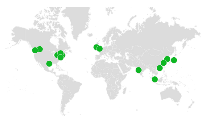
Vancouver • Calgary • Houston • Toronto • New York • Montreal Boston • Dublin • London • Mumbai • Singapore • Hong Kong Shanghai • Seoul • Tokyo

TD Securities operates out of 15 key financial centres, offering corporate and investment banking and capital markets products and services to a global client base. TD Securities' European operations are centred in London with approximately 460 employees. The London office is important to the overall TD Securities strategy. In March 2023, TD completed the acquisition of Cowen Inc. and in April 2024 UK employees of Cowen Execution Services Limited will be integrated to TD. London employees perform a wide range of client-facing and support & control function roles across various businesses.